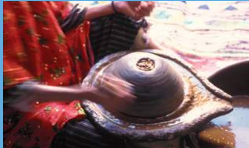
A Berber woman works at extracting argan oil

The world's largest area of argan forest lies between Essaouira, Agadir and Taroudant – a national treasure and also, with its goats perched nonchalantly in the treetops, a highly popular excursion destination. Visitors here can enjoy unspoilt natural surroundings, where argan, almond, and olive trees grow wild side by side. And while you're in the area, you can admire the know-how of the women as they work at extracting argan oil, and appreciate the traditional hospitality of Berber culture.