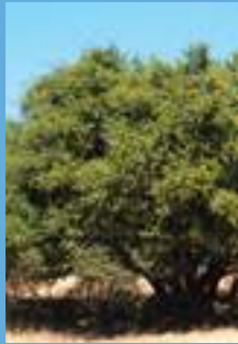
An argan tree – the tree is endemic to Morocco and only grows in the Essaouira region