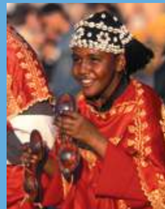
A young Gnaoua musician playing the krakebs (castanets)