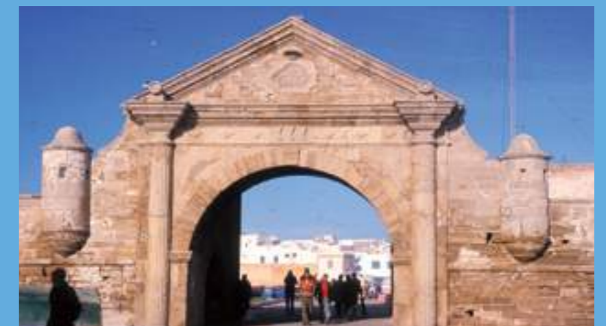
The Sea Gate

More than just a town, Essaouira is a muse, a source of undying inspiration.