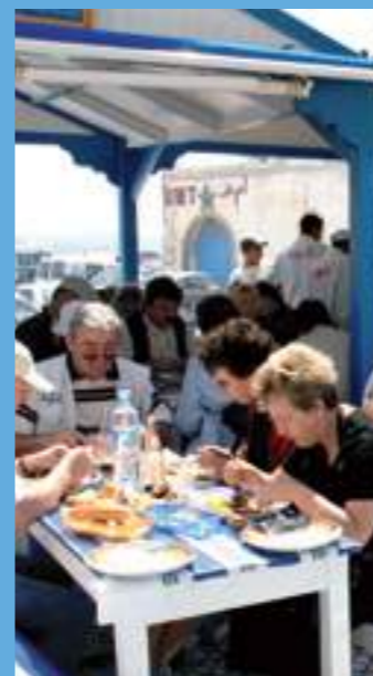
Grilled freshly caught fish in the port's little restaurants