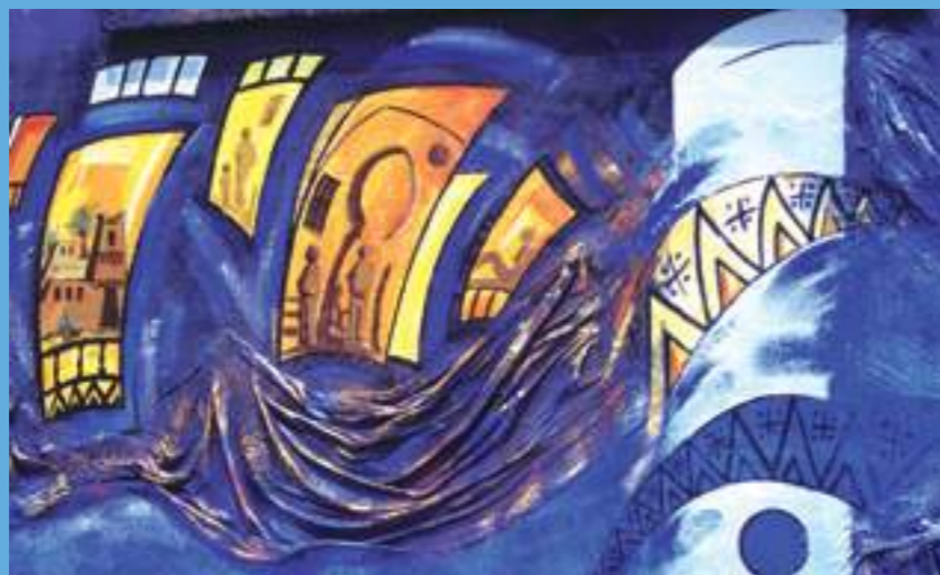
A painting by a Souiri artist

Essaouira's silver jewellery is renowned for its quality and finesse. The craft owes its existence and fame to the Jewish silversmiths of the 18th century. Design and manufacturing techniques remain almost unchanged from those of days gone by, and the craftsmen's creativity is inexhaustible.