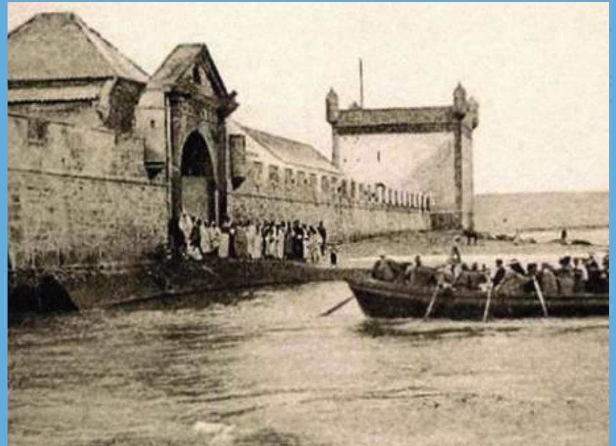
Tourists arriving at the Sea Gate before the port was built (1910)