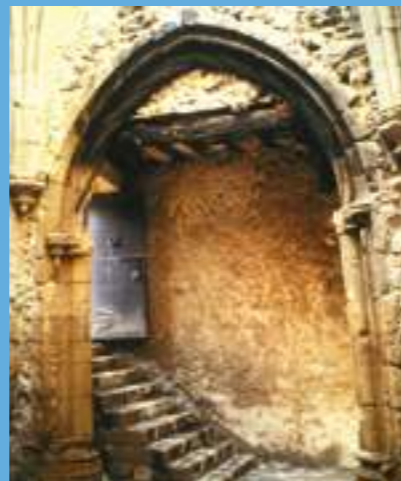
A Portuguese-style doorway