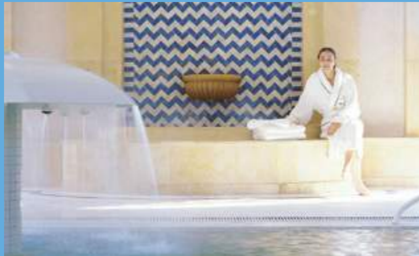
The town is also famous for thalassotherapy

The wind blows hard across Essaouira Bay. And while others may appreciate the protection offered by the city walls, surfers, windsurfers and kiteboarders have no hesitation in taking to the water. Over the last few years, the town has become a highly popular destination among water board sports