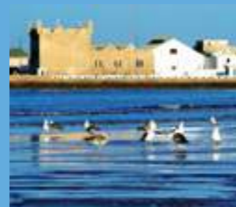
The Purple Islands, a bird sanctuary