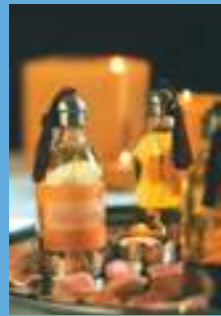
Natural cosmetic products produced from argan oil and used for body and beauty care