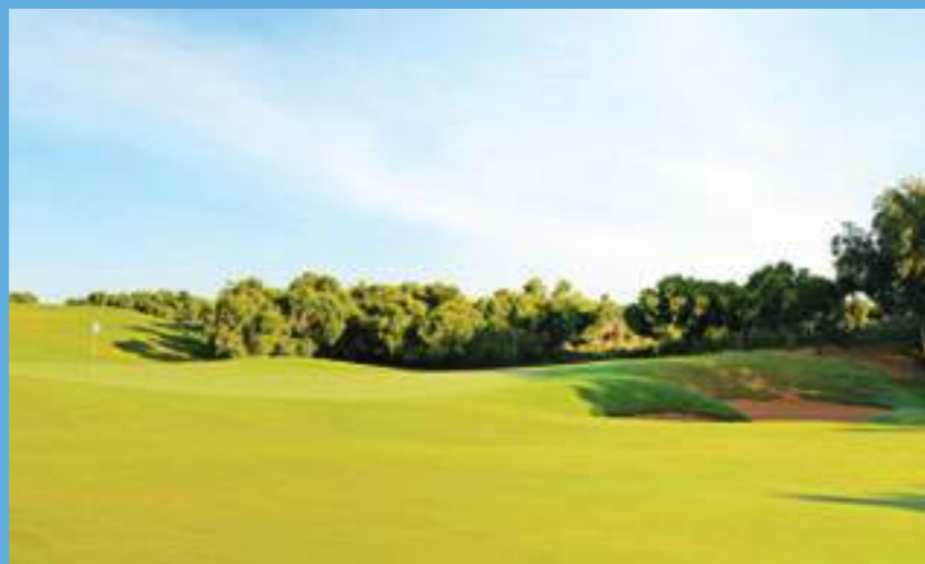
Mogador Golf Club