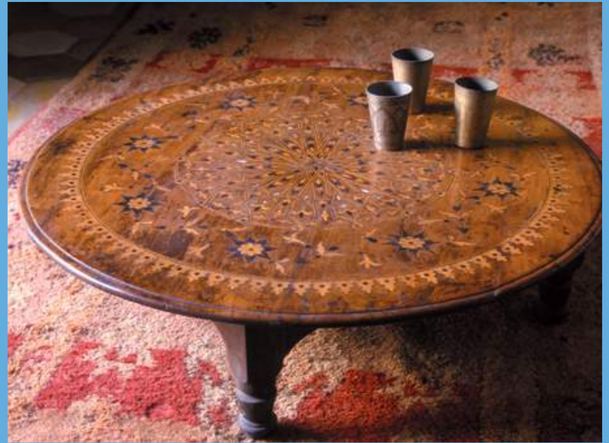
A thuja wood table created by the city's master inlayers