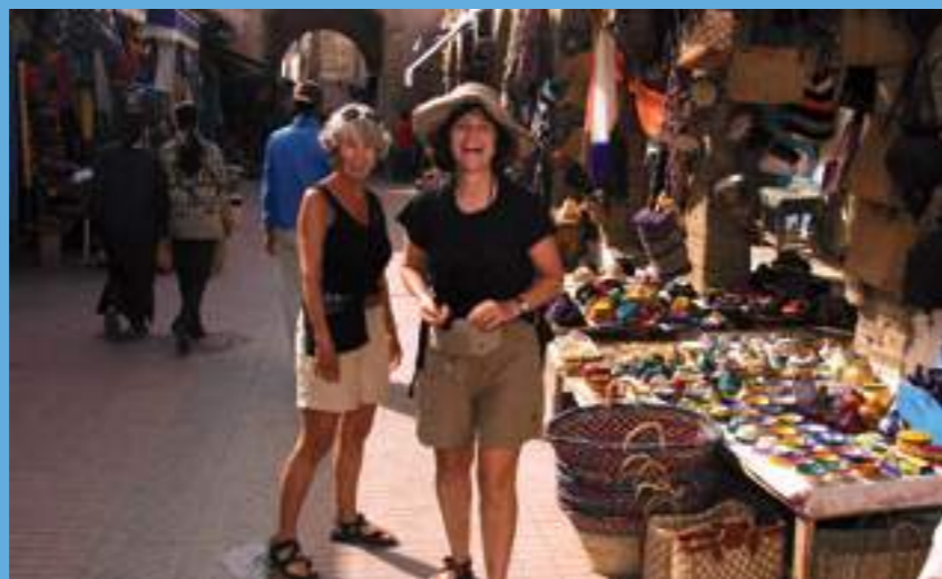
Strolling through the old medina's streets to discover its craftspeople and their know-how

Moulay Hassan Square is Essaouira's nerve centre – the liveliest place in town! Situated in the medina, not far from the city walls and the port, this pretty tree-filled square is an ideal setting for enjoying a glass of mint tea. Sit back on one of its café terraces and watch the casual comings and goings of the passers-by.