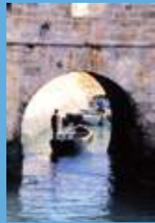
A fisherman home from the sea