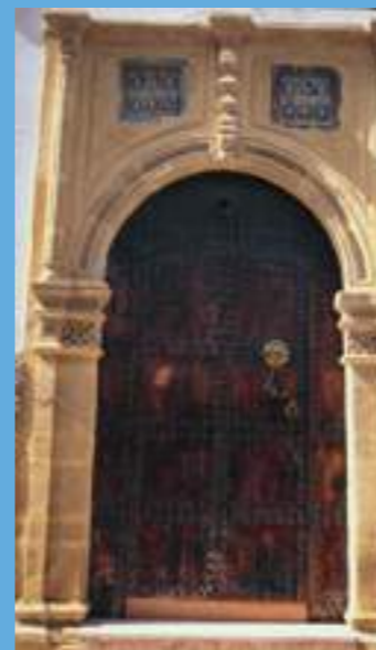
A typical medina doorway

protect the port, the Sqala is lined with cannons, and you can walk the length of its ramparts and be rewarded by breath-taking views of the island of Mogador and the fishing port. Connecting the town to the port, the Sea Gate is of imposing grandeur. Built in 1769, this monumental freestone edifice is adorned with twin columns and a triangular pediment. Protecting the city from attacks by sea, the north bastion is a vast artillery platform surrounded by crenellated walls. Its terrace provides unparalleled views of the medina and the Sqala.