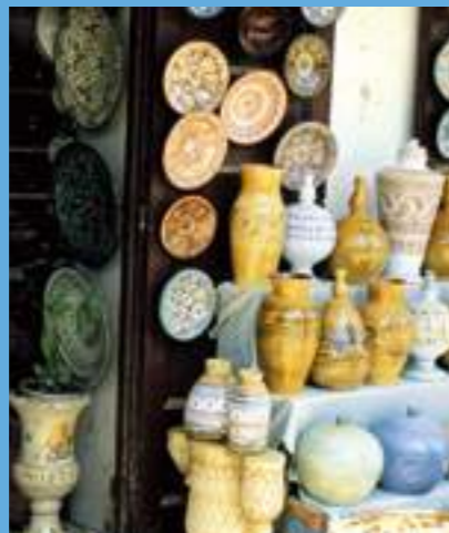
A pottery shop