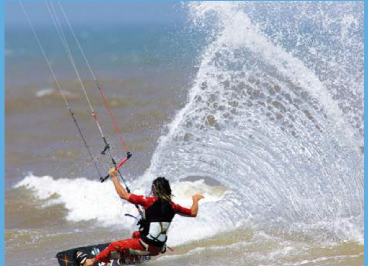
A kiteboarder skimming the waves. Each year, the town hosts an international kiteboarding competition