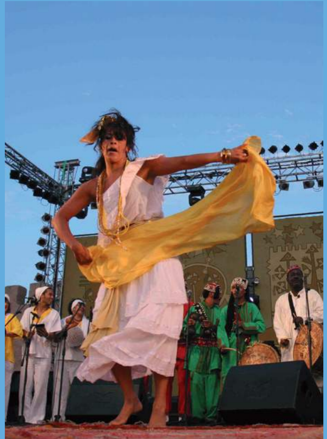
The Gnaoua Festival, held every year in Essaouira, attracts a wide public