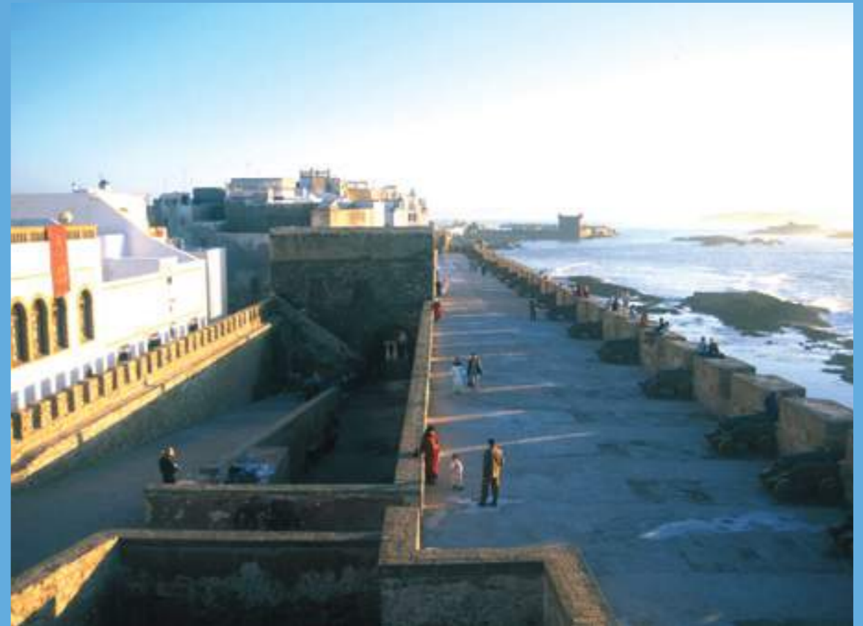
The walkway along the Sqala ramparts