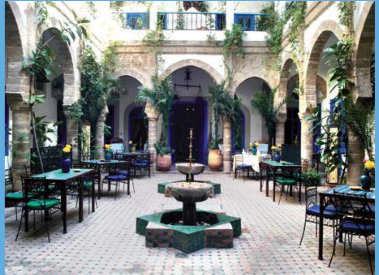
The patio of "Riad Al Medina", where the famous guitarist Jimi Hendrix stayed in 1969

The Purple Islands owe their name to the purple pigment extracted from the murex, a type of shellfish. Applied as a dye, it turns fabrics a rich red colour with highlights ranging from maroon to violet. In Antiquity, red was the symbol of temporal and spiritual power, and the colour purple was much sought after by the Roman aristocracy.