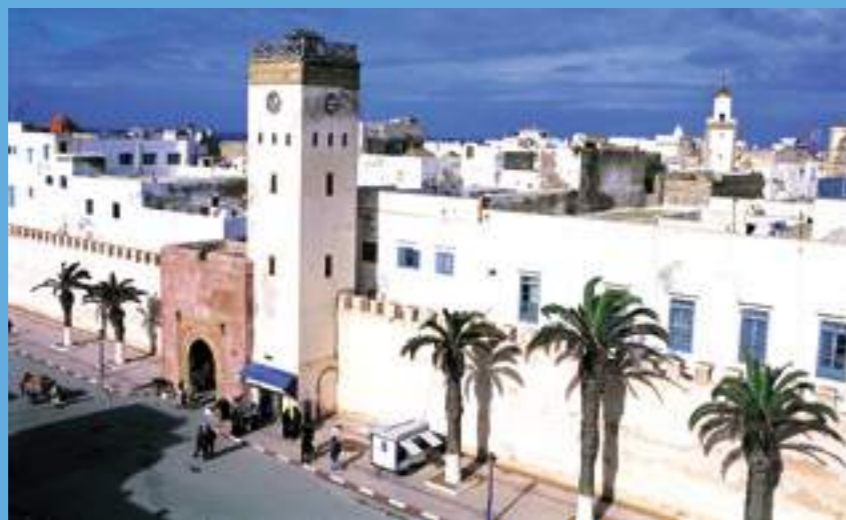
A view over the medina

These days, Essaouira is a haven of peace that inspires artists from all over the world. Listed as a UNESCO World Heritage site, its medina remains untouched by the passing centuries, seemingly impervious to the ravages of time. Behind its walls hides a luminous city of winding alleyways, picturesque little squares and whitewashed houses. Used by Orson Welles as the location for his film of “Othello”, it has inspired and enthralled a host of later filmmakers. Ridley Scott, for one, recreated Jerusalem here for his film “Kingdom of Heaven”. In the 1960s and 70s it became a playground for Jimi Hendrix and numbers of his fellow musicians, and continues today to live to the hypnotic rhythm of Gnaoua drums.