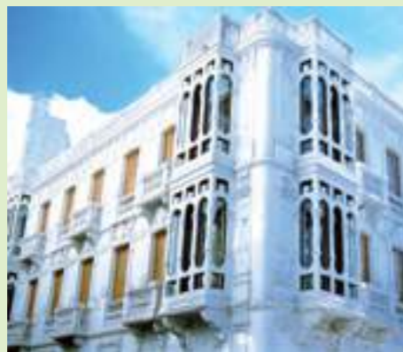
The Cervantes Library, Tetouan

As for Saïdia, its proximity to the natural wonders of the Zegzel Valley, to the medina of Oujda, capital of the Oriental region, and to the historic oasis of Figuig, is an advantage that makes the resort more than worth a visit.