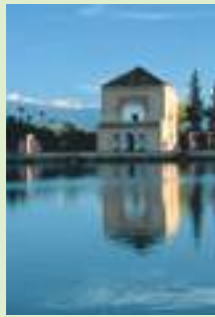
The Menara, Marrakech