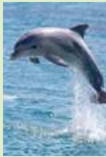
A Nature reserve in the Saïdia region

In the north of Morocco, where the Mediterranean Sea meets the Atlantic Ocean, three superb courses are at your disposal, all of them popular with European players, who flock to the area to test their skills summer and winter alike.