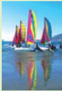
Water sports in Agadir

Agadir is becoming one of Morocco's top golfing cities, offering players a whole range of attractions alongside the pleasures of the game itself – encounters with other cultures in its magnificent hinterland, wellness and fitness care in its thalassotherapy centres, and, of course, all the mouth-watering delights of Moroccan haute cuisine. Set between mountain and sea, with 360 days of sunshine a year, a mild climate whatever the season, and a bay boasting 10 kilometres of white sandy beaches, Agadir is an altogether unique golfing destination. Its four existing clubs, their fairways giddy with the mingled scents of eucalyptus, broom and mimosa, are soon to be joined by two new additions - the Taghazout Golf Club and Golf Beach.