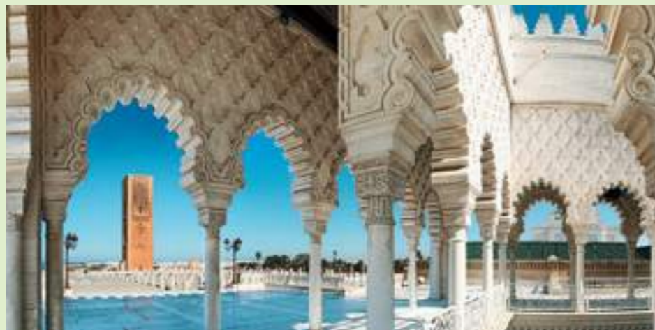
Mohammed V Mausoleum, Rabat

Treat yourself to a slice of the Kingdom's culture and history, while perfecting your game at one or all of the ten clubs to be found along the way as you tour its cities.