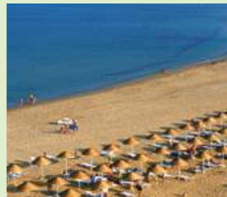
Tamuda Bay beach