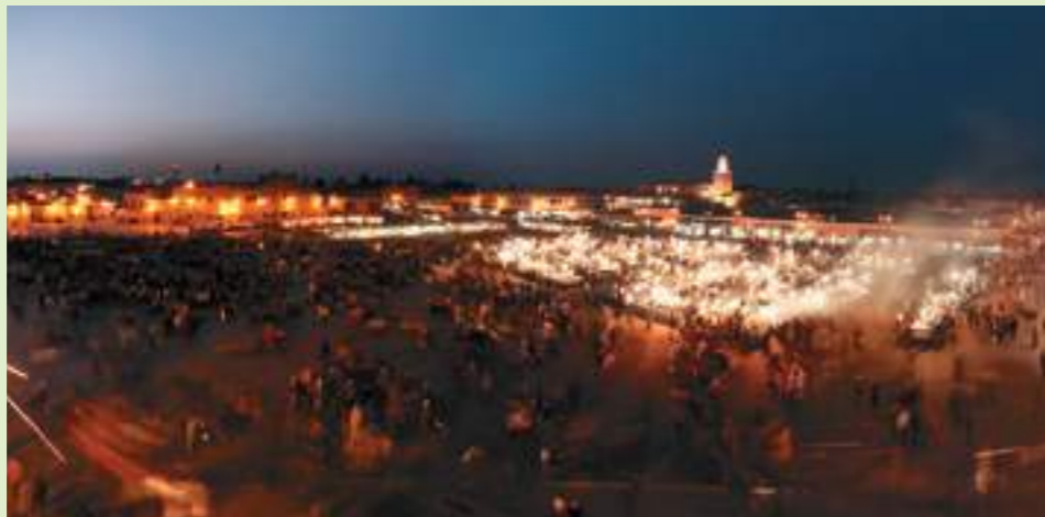
Jemaa El Fna, Marrakech

Marrakech is the golf city par excellence. Created in 1923 and headquarters of the David Leadbetter Golf Academy, one of the world's finest golfing schools, the Marrakech Royal Golf Club is the second oldest in Morocco. Its greens have been trodden by such eminent figures as Winston Churchill and Dwight Eisenhower... Marrakech has expanded its golfing activities considerably since the early days, and the city is now surrounded by four clubs, their courses lying at the feet of the snow-capped High Atlas Mountains. Here you can enjoy a round of your favourite game, breathing in the cool afternoon air after a hot day in the sun – and there will still be time afterwards to take in a more cultural round of the city's monuments. From Jemaa-el-Fna, Marrakech's festive nerve centre and listed as a UNESCO World Oral Heritage site, let your footsteps lead you to one of the city's many gardens (the Menara perhaps, or the Majorelle), and then onwards to explore the labyrinthine bustle of the medina's alleyways.