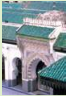
Al Quaraouiyine Mosque, Fez